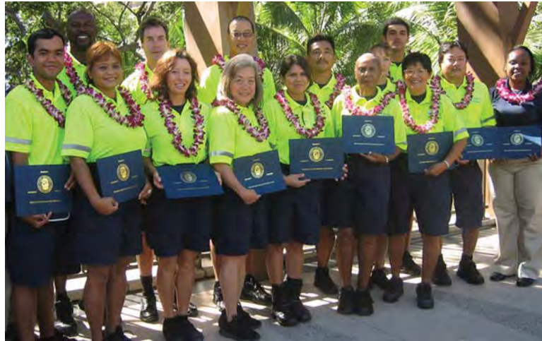
The Aloha Ambassadors were presented with certificates of appreciation from the Honolulu Police Department.