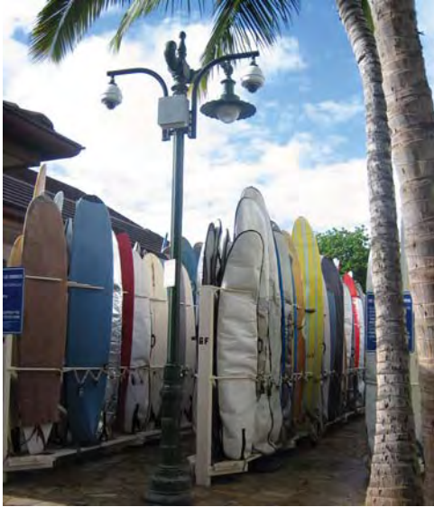
Security camera monitoring was expanded to include ten cameras installed at the Kuhio Beach Surfboard Locker area.