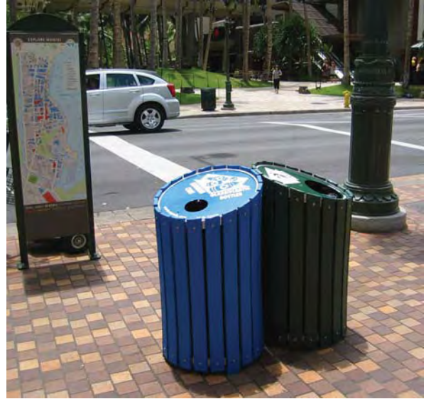
25 sets of litter and recycling bins were installed along Kalakaua and Kuhio Avenues.